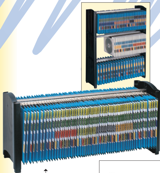
↑ A convenient and attractive desk rack is available. The rack can also be stacked to a maximum of 3 units.